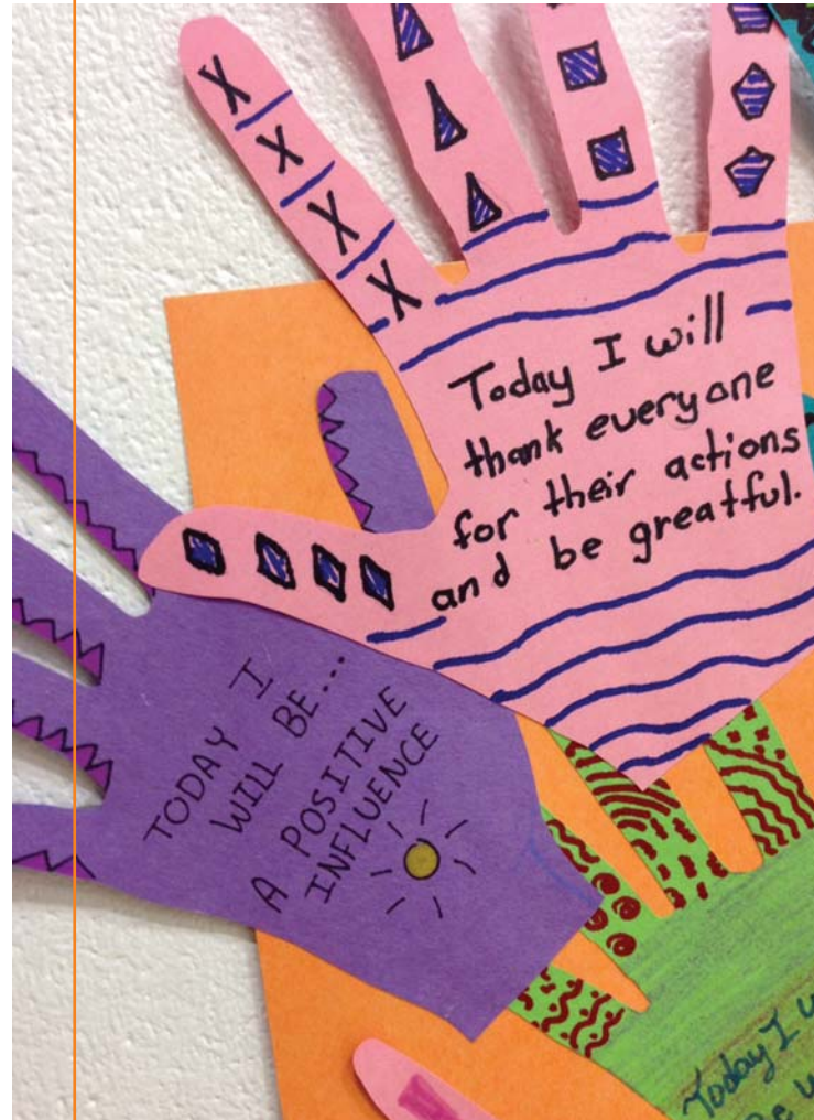
"Belonging" project, Fee Otterson Elementary/Junior High School